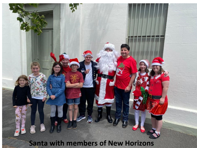
Santa with members of New Horizons