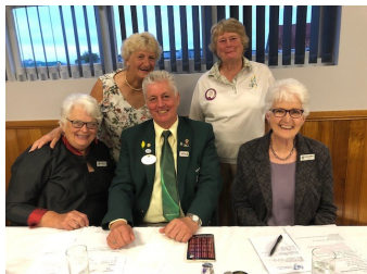
The all ladies executive at LC Kentish