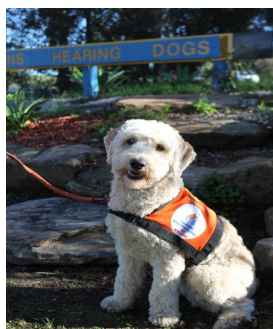
To forever home.....

We are delighted to announce Jakeb ALHD No. 600 has been delivered to his happy new owner in Victoria. Sincere thanks go to everyone connected to the training and placement of Jakeb. Well done.