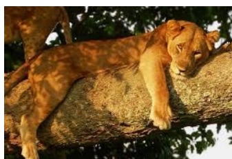
Lion Leonora on holiday getting some REST.....