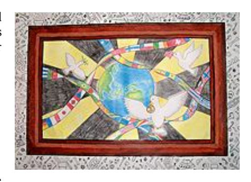
Above: Winner - Ellie (W1) from North Beach

Ellie's quote on the poster is "Inside the frame in my picture is my vision of peace – a world without war and conflict – living in harmony."