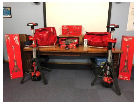
LEFT: An outstanding donation of vital equipment was presented to the Huon Fire Brigade.

A part of an effort to support the Huon Community in the wake of the bushfires earlier this year the Lions Club of Huon decided to assist the Huon Fire Brigade by supplying equipment not otherwise provided by the State Fire Service. In this effort the Club received assistance from a Victorian Lions Club, the Red Hills and District Lions Club. As a result equipment to the value of over $3250 was presented to the Huon Brigade last week. It is understood that the equipment supplied will be used as required by the other Brigades in the Huon area.