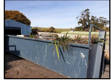
Right: Skip donated by local business