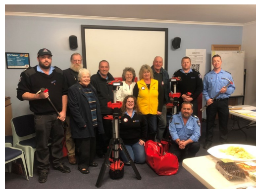
Members of the Huon Lions Club and Huon Fire Brigade at the presentation.