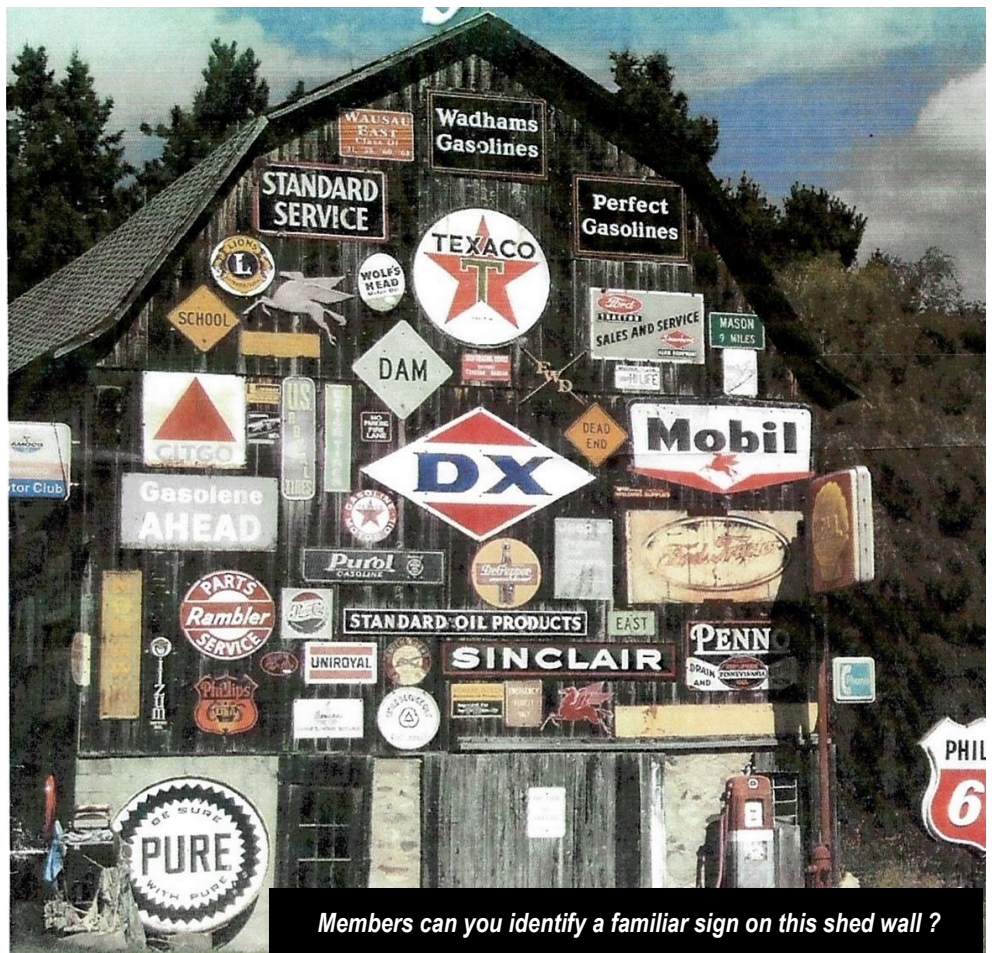
Members can you identify a familiar sign on this shed wall ?

The GMA equips Districts to develop membership through a strategic process, focused on rejuvenating