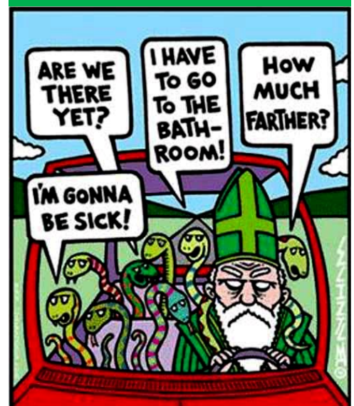
St. Patrick driving the snakes out of Ireland.

Below: A bit late for St Pat's Day last month, but tickled my funny bone!