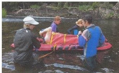
More training— floating on a packraft