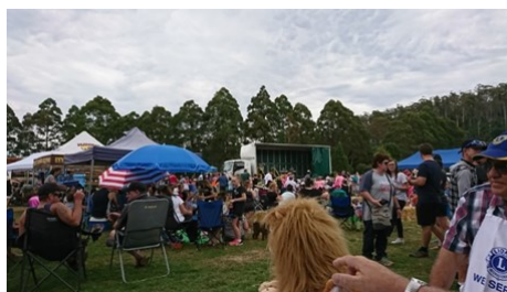
The "lions" watch over the event!

Twelve members of the Windmill Hill Lions club attended and, along with planning and conducting the Barbecue, also promoted Lions Club Activities as a part of Lions Awareness Day. As this project was already planned, it was considered best to use this opportunity to promote Lions activities.