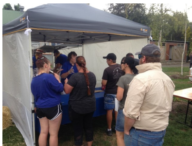
Feeding the masses – before the rush begins!

The Lions Club of Launceston-Windmill Hill provides the Facilities and Labour for the barbecue of donated hamburgers and sausages at no cost, with all profits going to St George's School. This is an annual project that we have attended for many years.