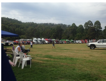
Some of the Trucks arriving and on display

This event, conducted by the Tasmanian Truck Owners and Operators Association (TTOOA) is for the St Georges School in Ravenswood Tasmania. The TTOOA members and provide immaculately presented trucks which each takes a special child and carer around the Launceston CBD and the out to Myrtle Park, a popular picnic spot 30 KM from Launceston on the Tasman Highway.