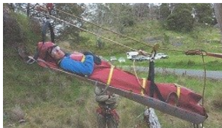
A Petzl Nest stretcher being used in training