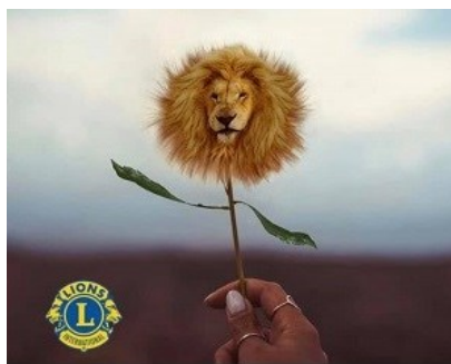
May Lions Grow and Flourish