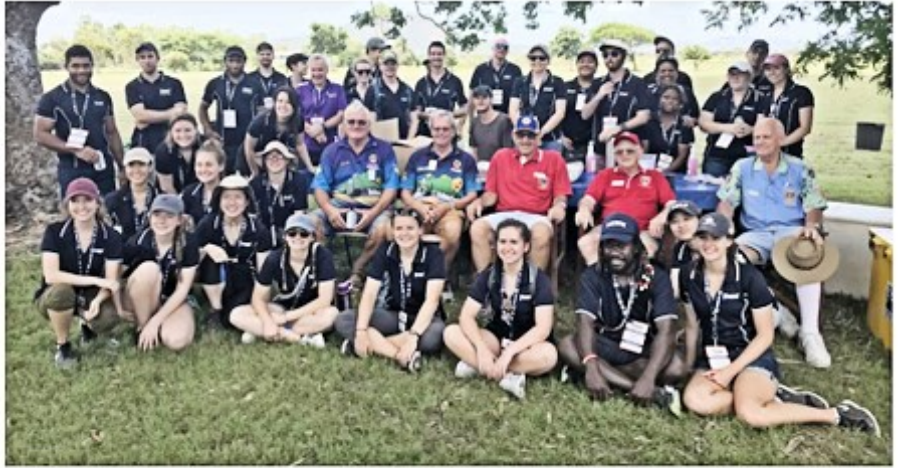
Townsville Lions Club members with the YWAM group volunteering with flood relief

The picture at right comes from the pages of the NORTHERN LION —the official newsletter of District 201Q2 .