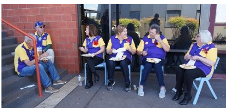
Convention committee— photos from Facebook.