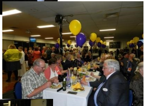
BELOW: Feasting and dancing at the Convention Banquet