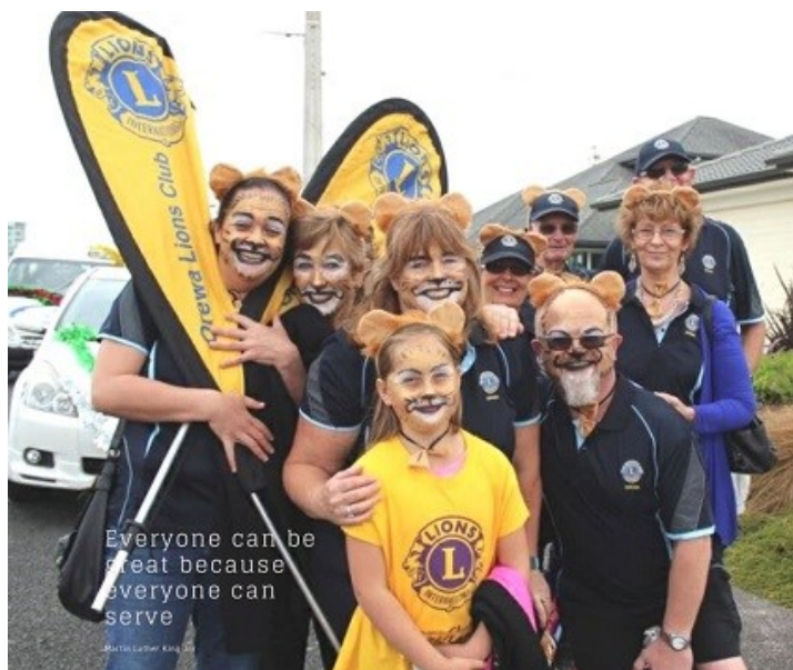
ABOVE: Smiling in Service are our friends from across the ditch in New Zealand

Saluting our New Voices for this month - the men who make women more visible in Lions. These Lions come from Portugal and are happy to support their female Lions in taking on Leadership roles in activities and committees.