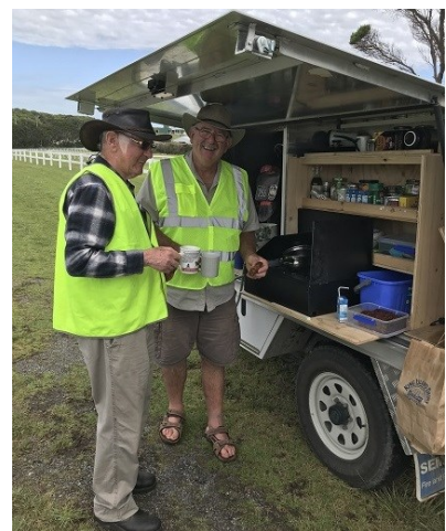
LC Glenorchy present themselves well with colourful Lions branding on their marquees and trailer.