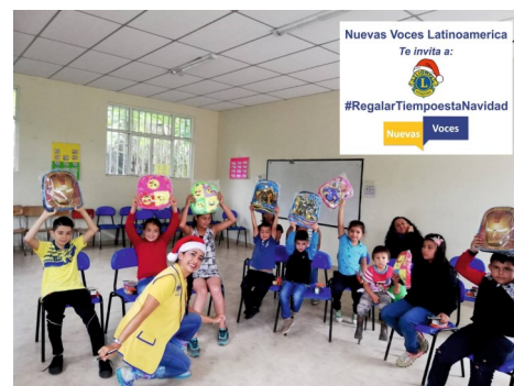
Christmas gifts and school bags to students in Columbia, from the New Voices Facebook page.