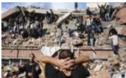
From LCI "Newswire"

Lions are bringing aid and comfort to the people affected by this disaster. LCIF approved an emergency grant to fund Lions' relief efforts. Our members are using these funds to provide relief supplies, including food and water.