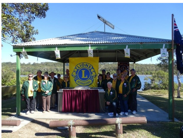
Above: LIONSONOZ Centenary Celebrations 29th July 2017 at Woolli NSW. Members are pictured unveiling a plaque commemorating the 8 years LIONSONOZ has been a club.