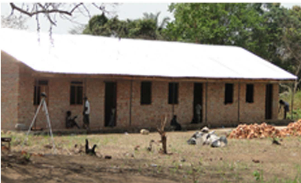
Alpha & Omega Christian Academy

Over 4 days a total of $2,647.68 was raised by making tea and coffee. Gold coin donations plus quite a few notes made up the very generous contribution,, which was put towards other fund raising efforts to build a primary school in Yambio, South Sudan.