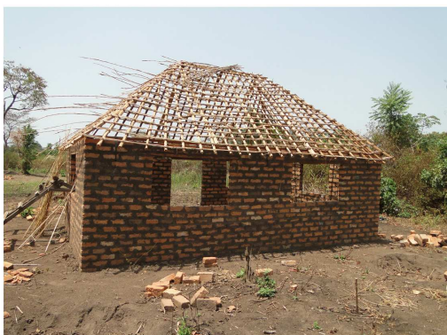
Staff Room (unfinished)

There are 4 Ugandan teachers using a Kenyan curriculum and teaching in English. (English is the new business language of South Sudan)