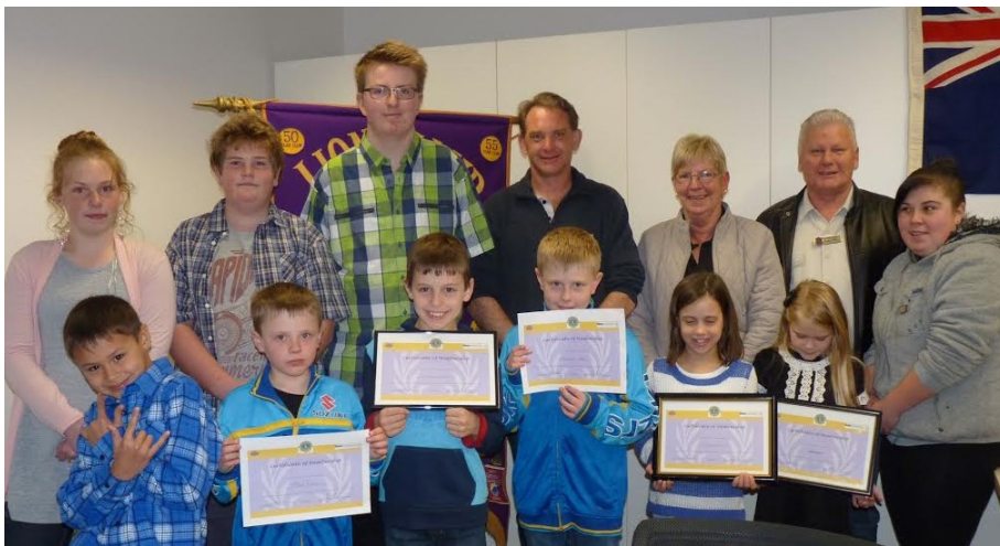
The mixed group of Lions, Leos, and Cub Lions. The three tiers of Lionism

That evening saw our Lions Club induct six Cub Lions and what a proud group of youngsters they were. They joined us at the dinner and each was presented with a framed certificate of membership. They were welcomed not only by the Lions members present but also by a number of Leos as well.