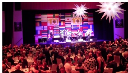
Music on stage at the Gala Ball. A final night with friends.