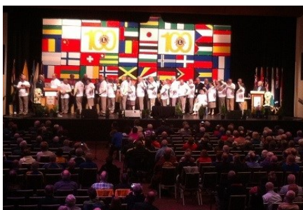
Our DGs swapping green jackets for inspirational T-shirts