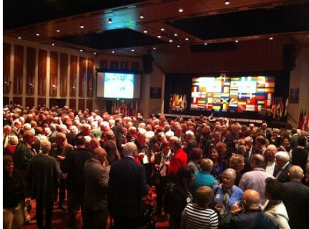
Friday night Meet and Greet