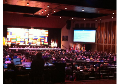
Saturday's Business session. Our 19 District Governors are seated across the front of the stage.