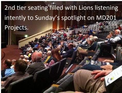
2nd tier seating filled with Lions listening intently to Sunday's spotlight on MD201 Projects.