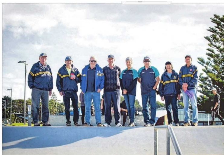
END OF AN ERA: The City of Devonport Lions Club has disbanded after 62 years of amazing service to the community.

The club recently made donations to nine different organisations before disbanding.