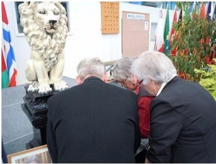
Left: Praying the sound & video system will work or fixing the raffle draws.....?