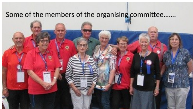
Some of the members of the organising committee.....