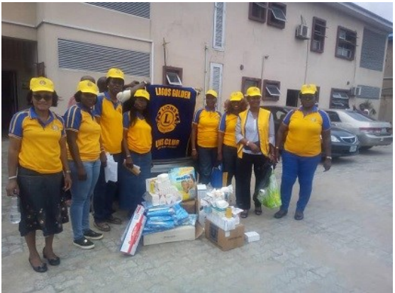
A Pediatric cancer awareness project is also being undertaken by Lagos Golden Lions