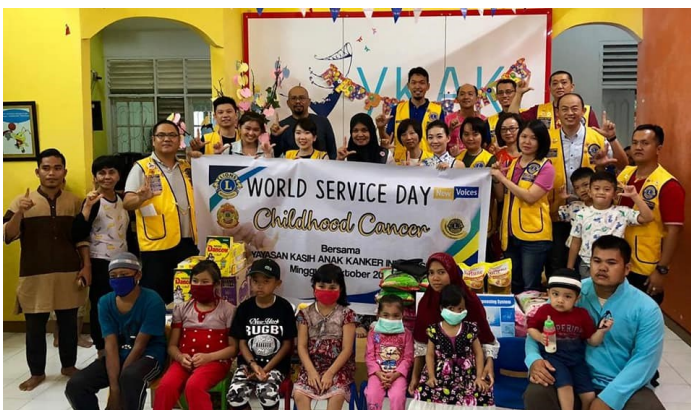
BELOW: Lions In Indonesia

A pledged periodic contribution : Many organisations accept donations to their cause via regular periodic direct debits from the donors account to the organisation's account. Shortly forms will be available for the same to operate in Australia to LCIF's Australian fund. At the end of each financial year a Tax Receipt will be