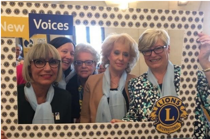
These Italian lady Lions are helping paediatric oncology in Genoa