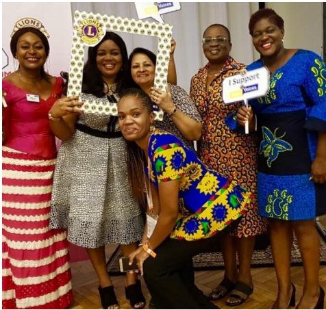
These friendly smiling New Voices attended a Symposium in Rabat, Morocco.