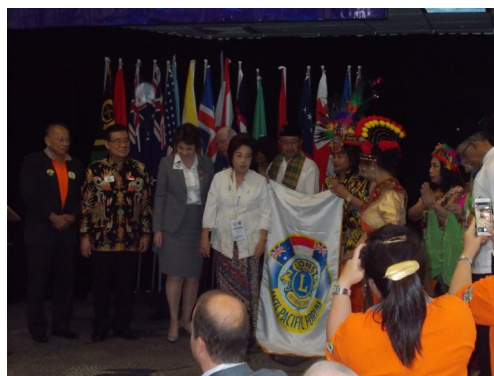
The Indonesian Delegation accepts the flag in readiness for next year's ANZI Forum in Jakarta.