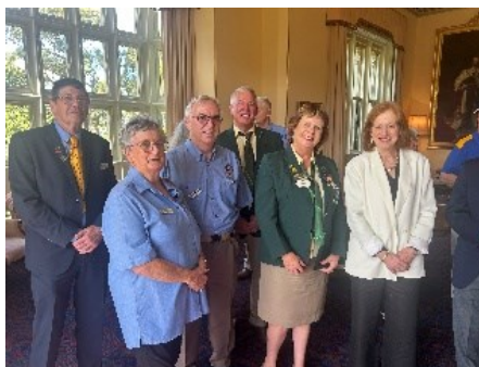
Clarence Lions Club visit to Government House

Congratulations to Wynyard Lions Club for receiving the Waratah Wynyard Council Australia Day 2025 Community Event of the Year Award for their 2024 Christmas Parade. What a fantastic achievement. I know how hard you all work towards that event – I have been trying to win the Christmas Trailer raffle for years!