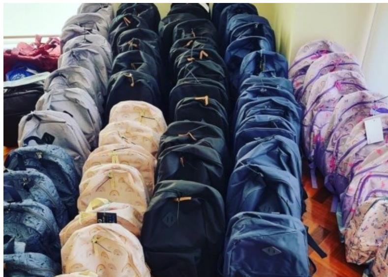
Above: 67 care-packs ready to send to Poland for Ukrainian refugees.

An initiative led by the Lions Australia Diabetes Foundation and Type 1 Diabetes Foundation is packaging up medical supplies to send to Ukrainian refugees with Diabetes.