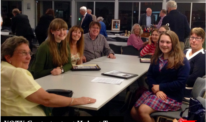
YOTY Contestants at Hobart Town

The two events were great nights, with every aspect going extremely well.