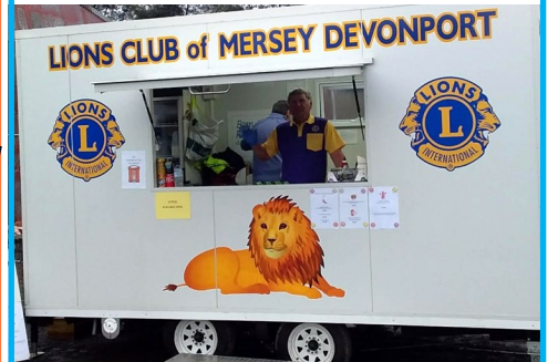
Lions Club of Mersey Devonport Food Van on site.

Resulting from that event, the Lions Club of Mersey Devonport presented the sum of $1,000 to the Don River Railway to assist with the rebuilding.