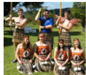
State winners of the Youth of the Year 2013 were rewarded with a visit to a Youth Camp in Opotiki, New Zealand