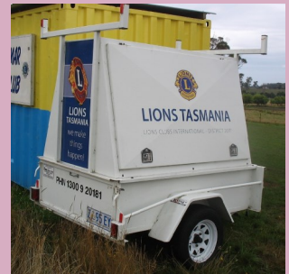
Van for hire