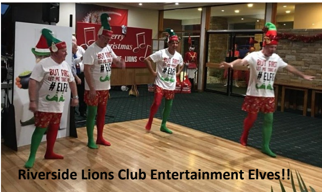
Riverside Lions Club Entertainment Elves!!