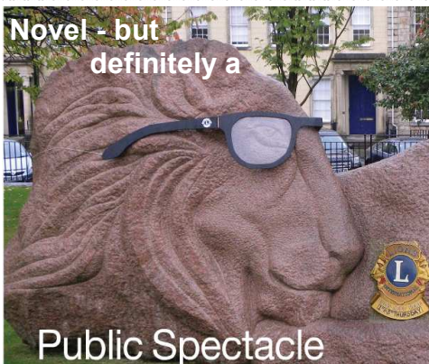
Novel - but definitely a Public Spectacle 20 ton granite sculpture in Edinburgh Scotland raising awareness of glaucoma!