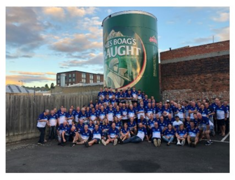
Participating Cyclists all gather together for a "Team Photo"

The Lions Club of Launceston-Windmill Hill (LCLWH) catered for the 121 PEDL4CURE Cyclists as well as their supporters at a Barbecue held at the Boags Brewery (Major sponsor of the ride) in Launceston. Nine LCLWH members and two supporters and one Riverside Lions member and partner, all pitched in on the evening of the 1st March. This event was well appreciated by the riders and their sponsors, generating valuable exposure and publicity for Lions in Tasmania.