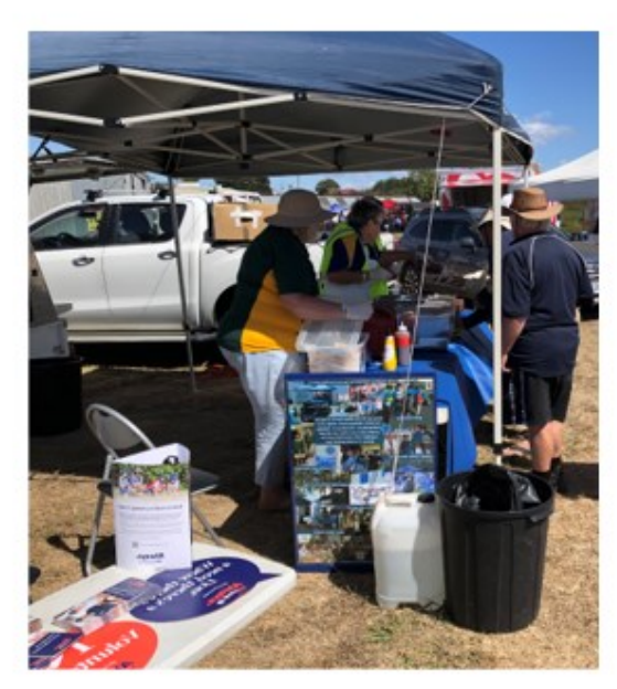
LCLWH Lions hard at work serving food

We also decided to conduct our "Lions Awareness" promotion at the well-attended event.