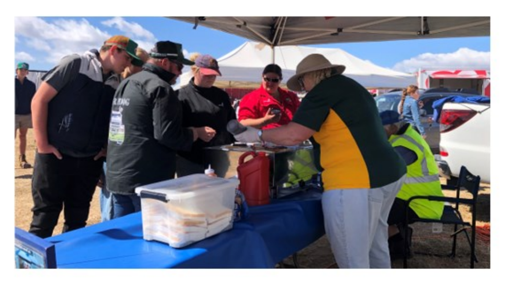
Feeding the masses - to the benefit of the Royal Flying Doctor Service

As they have done for many years now, Windmill Hill Lions have provided catering services at the TTOOA Trucker's Run – This year's beneficiary was the Royal Flying Doctor Service, who will receive all profits from catering, Raffles, auctions and other TTOOA activities. Our club's history goes back to when the run was originally to Myrtle Park 30 KM from Launceston.