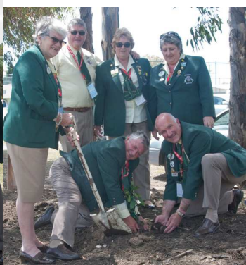
The two outer photos show the planting by two Spring Bay Life Members (LMTrees) and the other by two LYNX Leaders