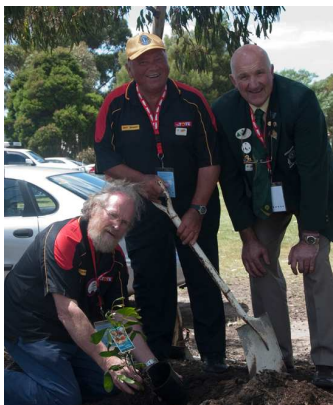
The centre photo shows a tree planted by the District Governors present at Convention