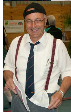
Would you vote for them?