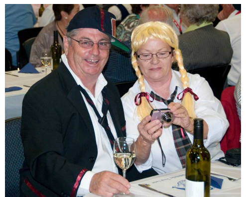
Suspicious characters at the dinner.

Two late notices of motion were received and delegates accepted these for debate.