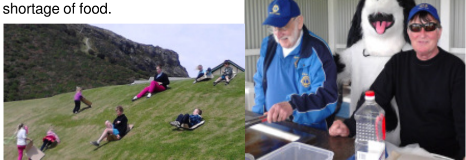
... we would have been hill sliding on cardboard too!